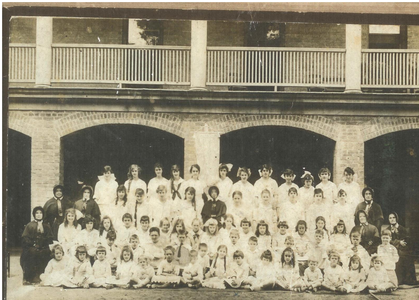
Top: Academy of OLM, 68 Legare Street. Sisters L-R