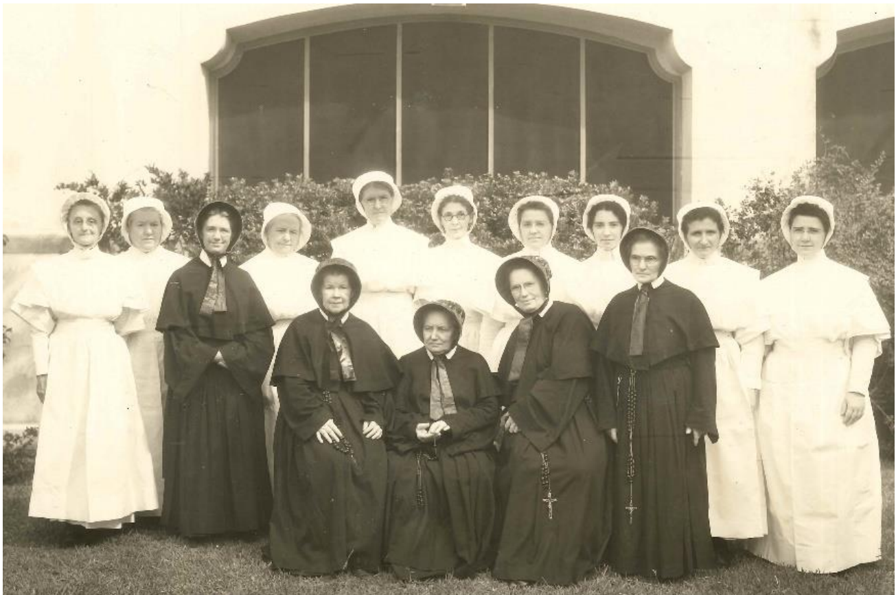
SFX Hospital Sisters